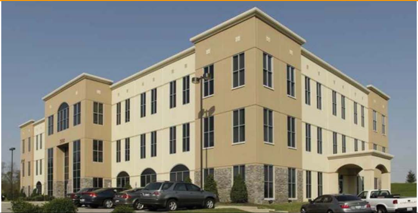
2650 Eastpoint Parkway